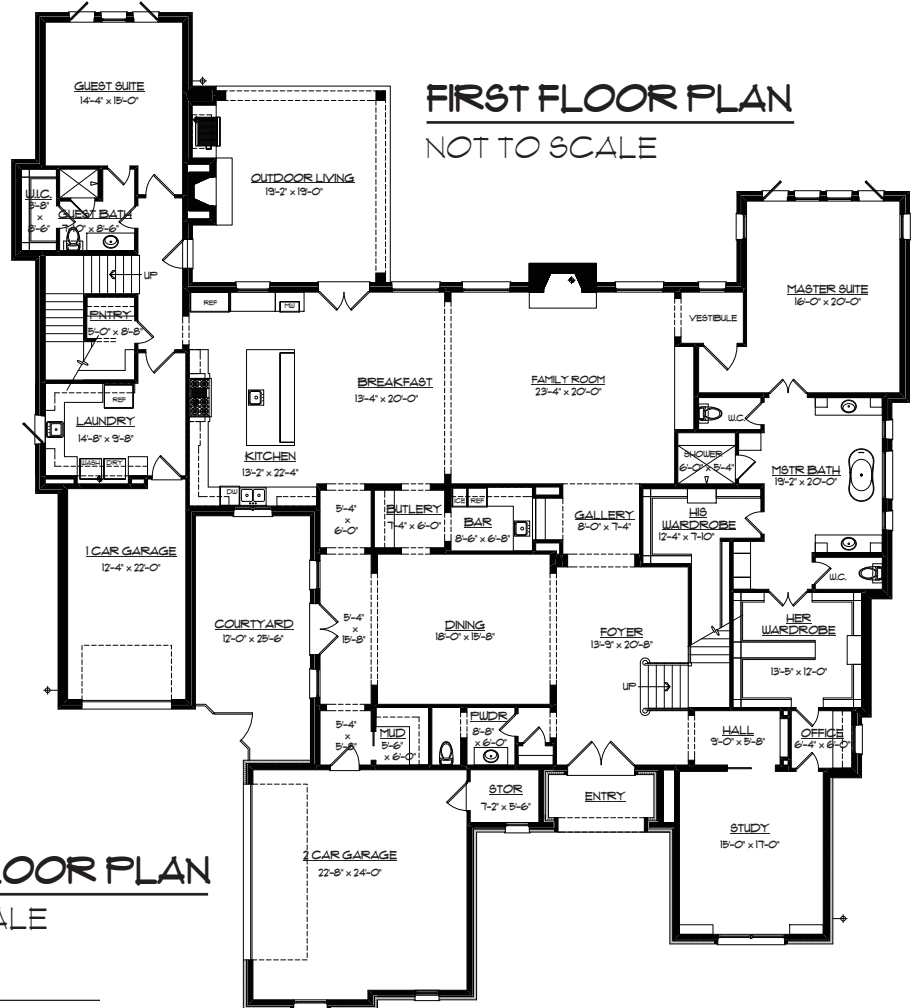
FIRST FLOOR PLAN NOT TO SCALE